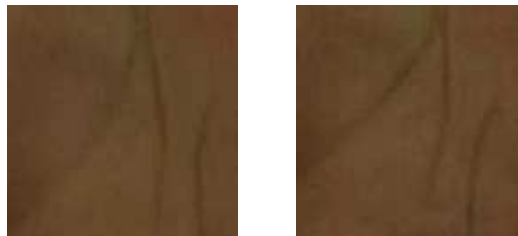
Figure 1. Palm line variations with change in view.

The cameras in mobile devices such as cell phones and laptops can effectively double as a biometric sensor, providing security and ease of use for access to the devices as well as other services. The cameras in such devices are fixed and the user presents the biometric modality in an unrestricted and intuitive manner. The captured images vary considerably due to variations in illumination, background, and pose as well as blur due to motion and incorrect focus. Methods for dealing with variations in illumination and pose have been studied extensively for modalities such as face [1] and gait [6]. The use of palmprint as a modality has the advantages of ease of presentation and discrimination ability com-