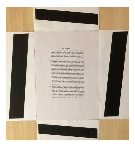
Fig. 1 . The figure shows a typical image and the slanted edge arrangement used to create the SFR dataset. The slanted edges are placed on all sides of the document. We use four slanted edges to capture the motion and out-of-focus effects robustly. The degradations in slanted edges due to these factors lead to a low SFR score, which in turn results in a lower ground truth value for all the affected patches.

The idea is to measure maximum input frequency the system is able to discern. The ideal 'one-shot' algorithm for this requires an input with all frequencies. This input can be a step-function which has all the frequencies uniformly dis-